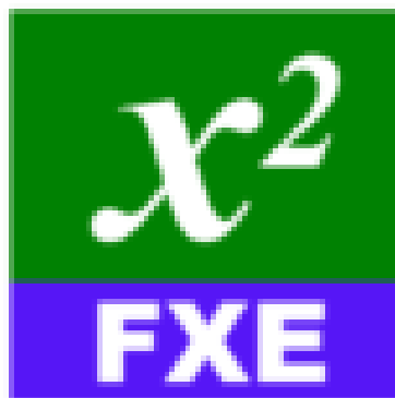
FX Draw Tools